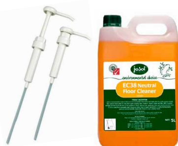
Easy and simple way to dispense chemicals