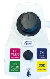
Ecomulti Dispensing Solution

“Our team loved the new Jasol dispensers. The look, practicality and functionality is excellent. The entire team have had nothing but great things to say about the new dispensers.