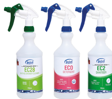
Screen Printed Spray Bottles to be used for diluted chemicals