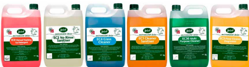
Colour Coded Chemicals